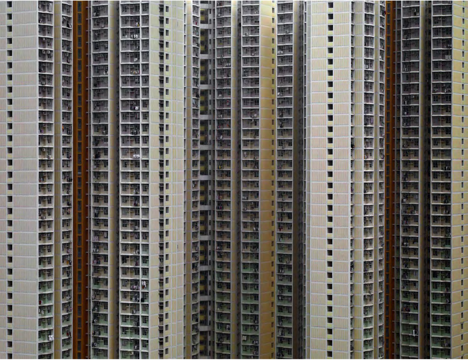
Architecture of Density #102, 2009