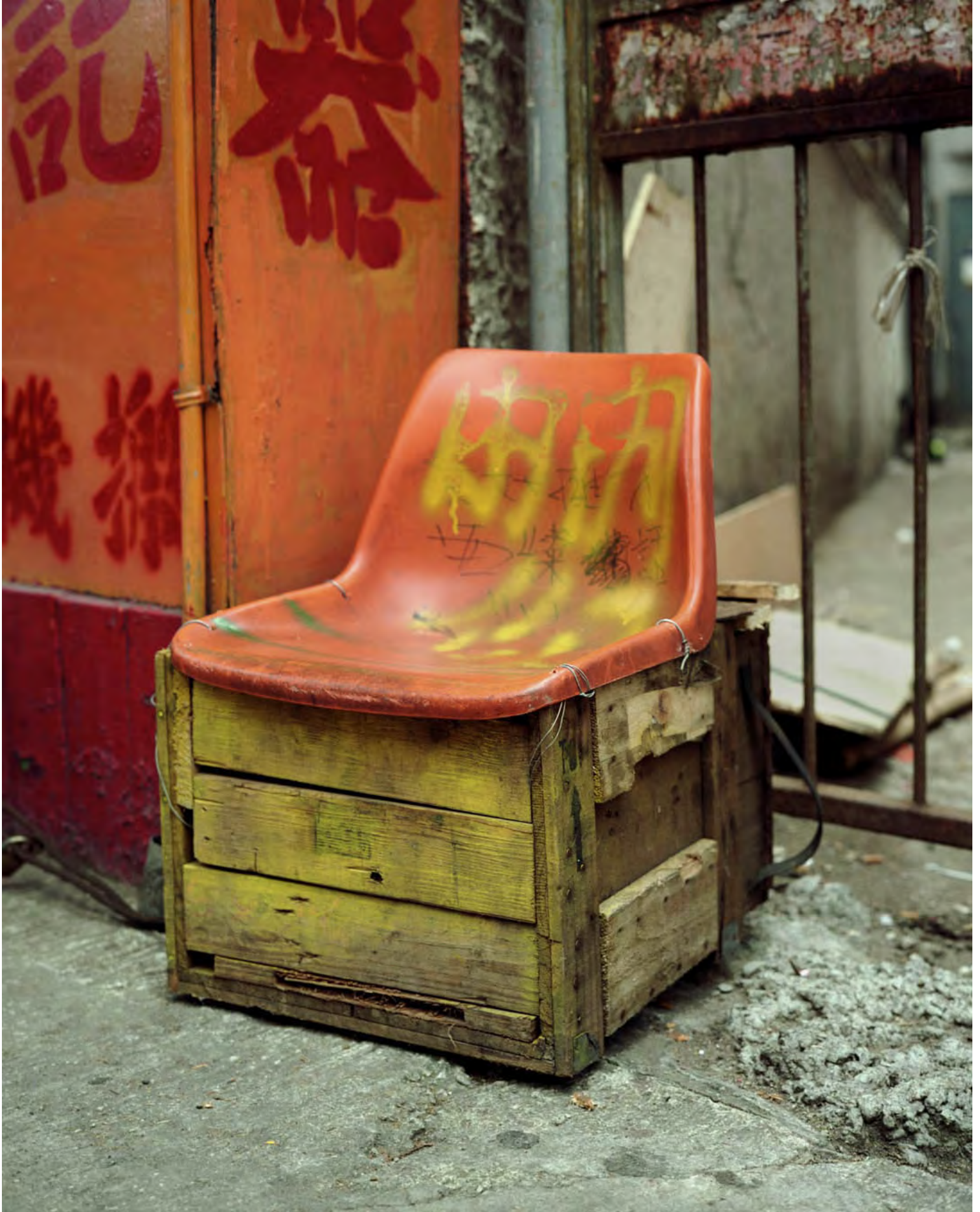
My Favorite Thing: Bastard Chair #13, 2015