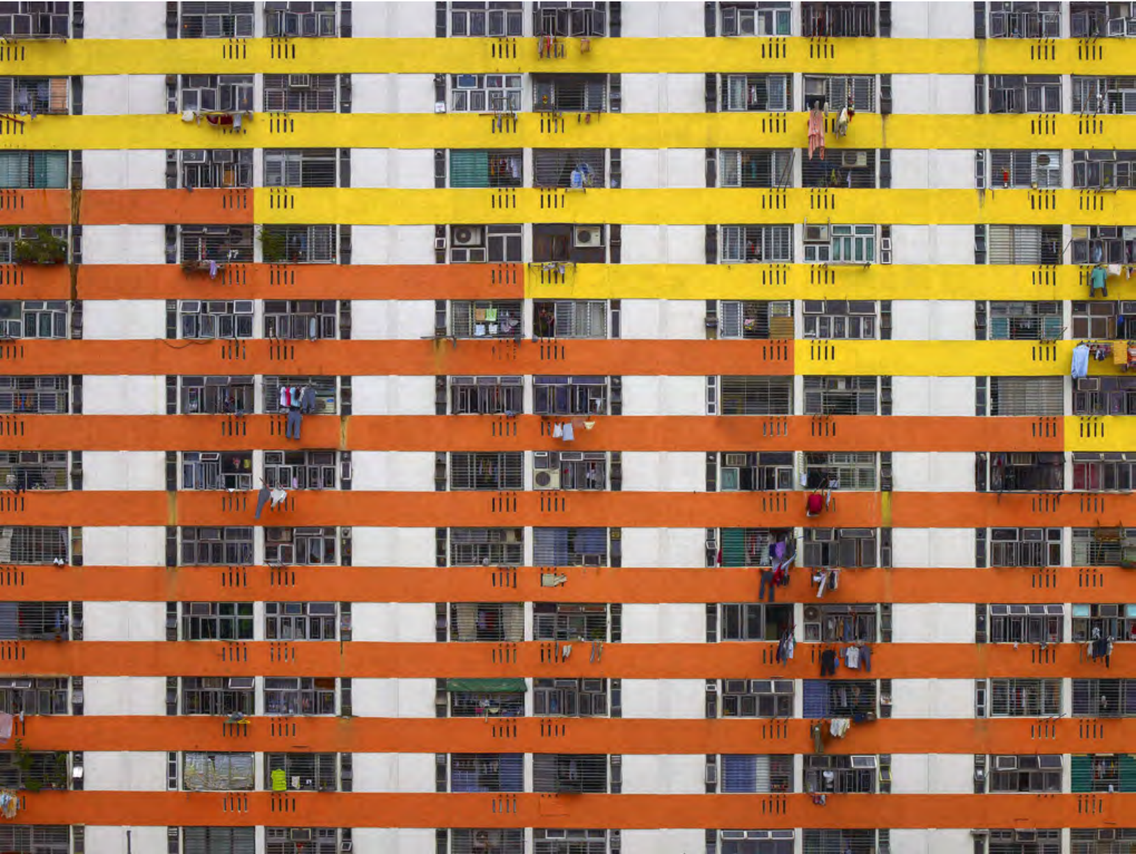
Architecture of Density #105, 2009