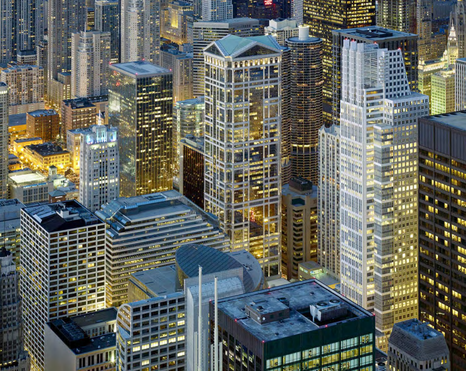
Transparent City #11, 2007