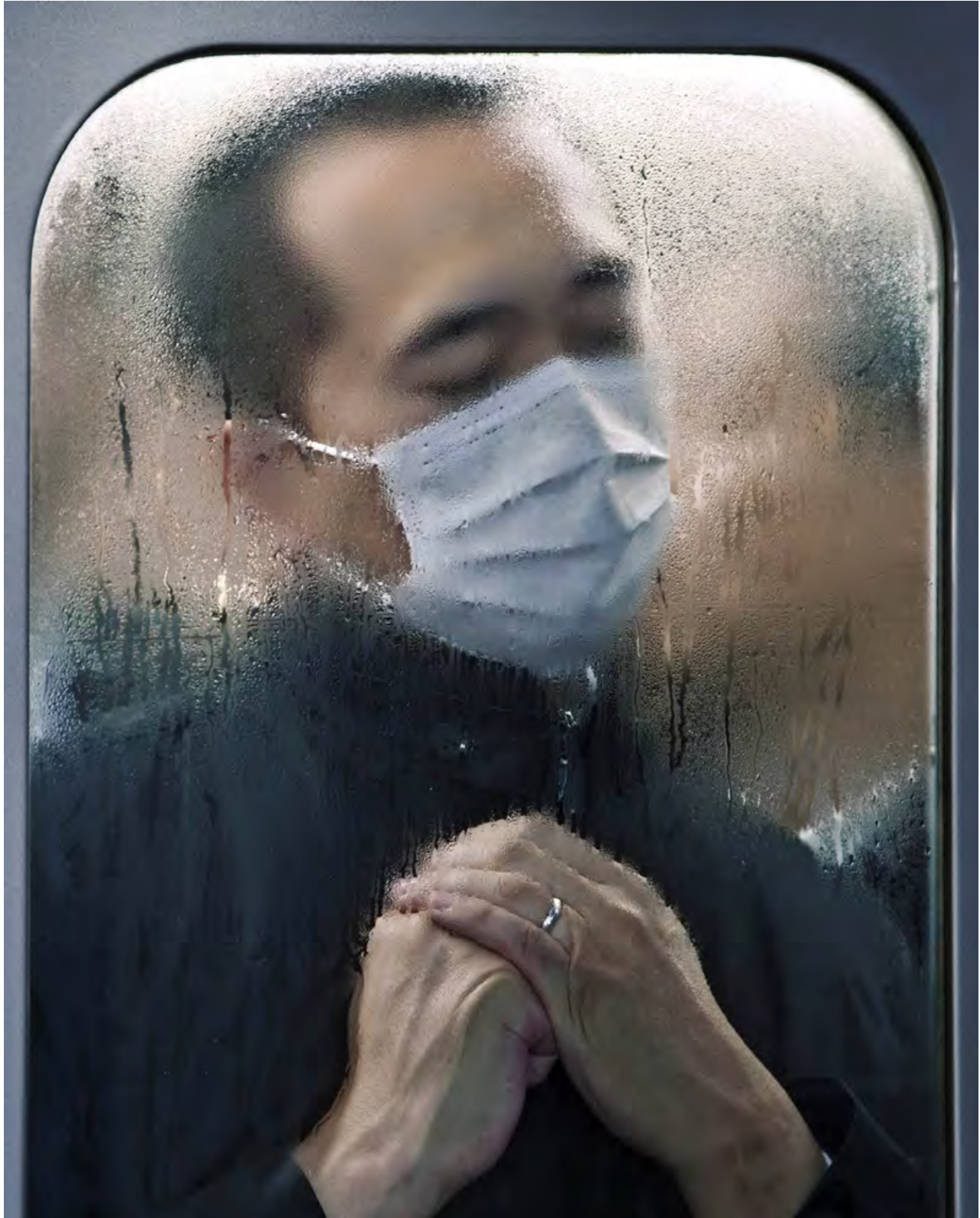
Tokyo Compression #75, 2010