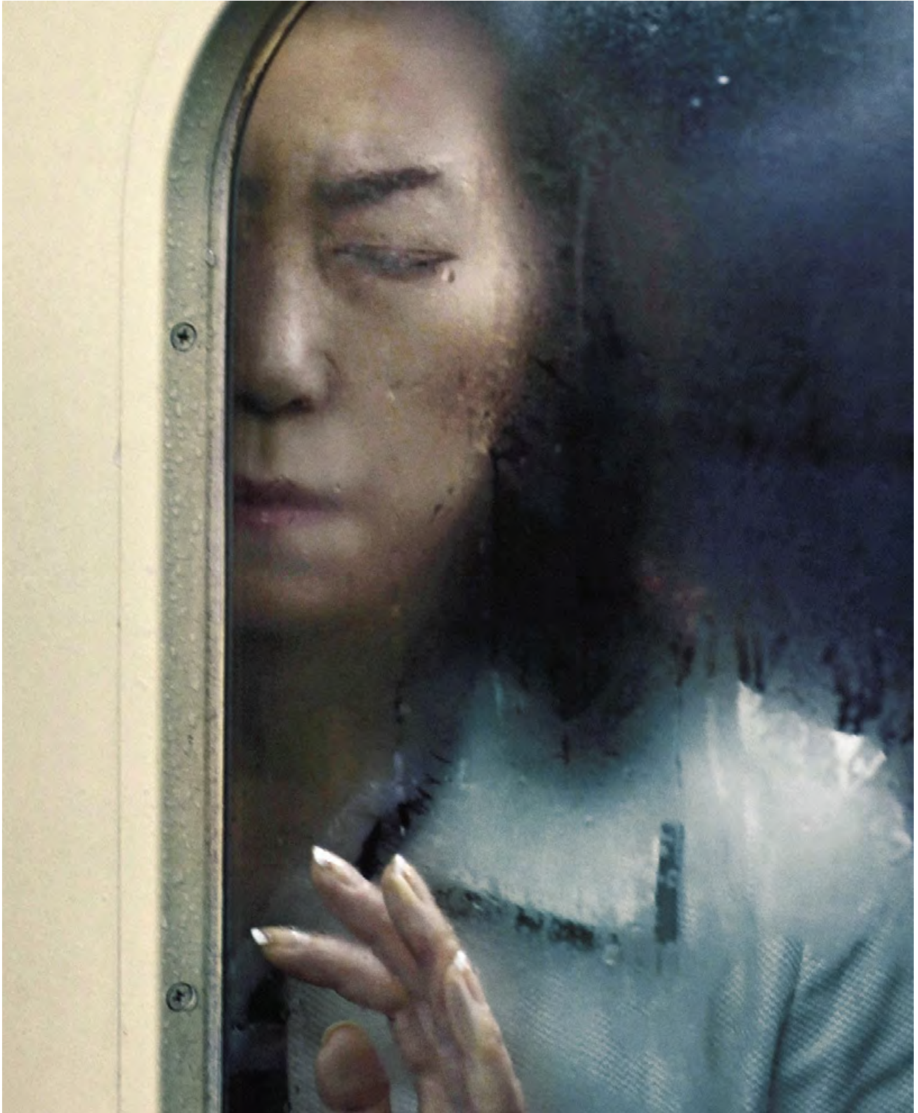
Tokyo Compression #39, 2010