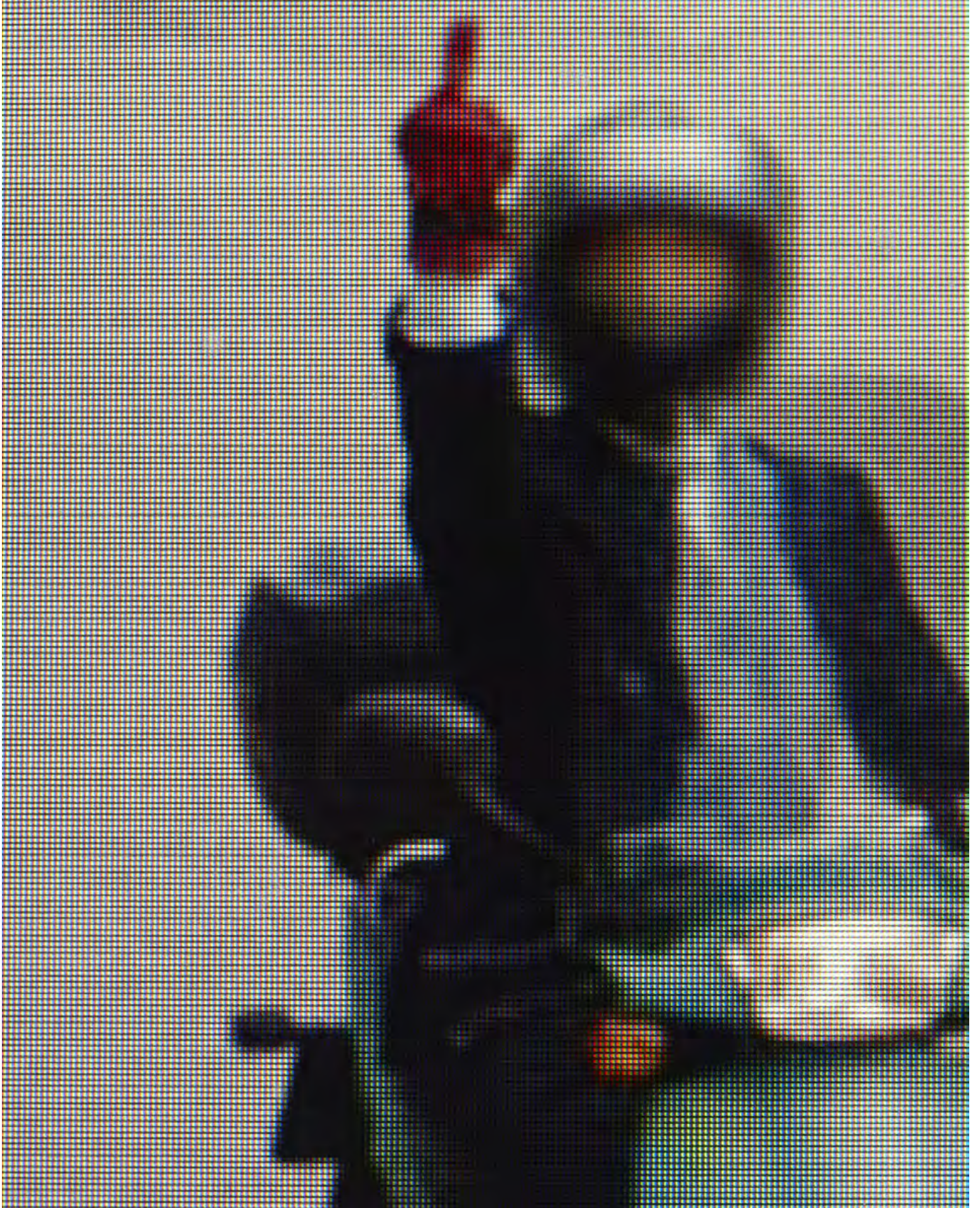
Paris Street View #9