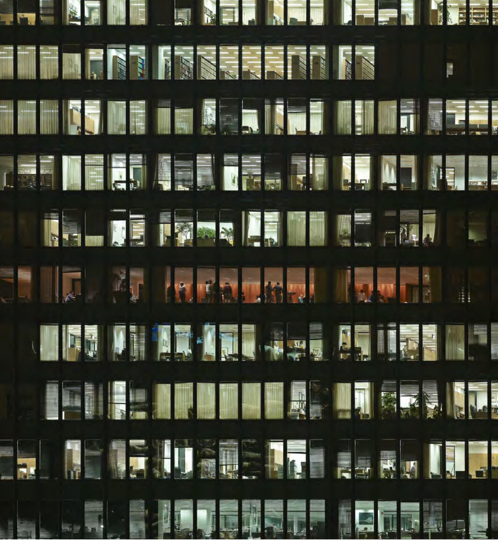
Transparent City #92, 2007