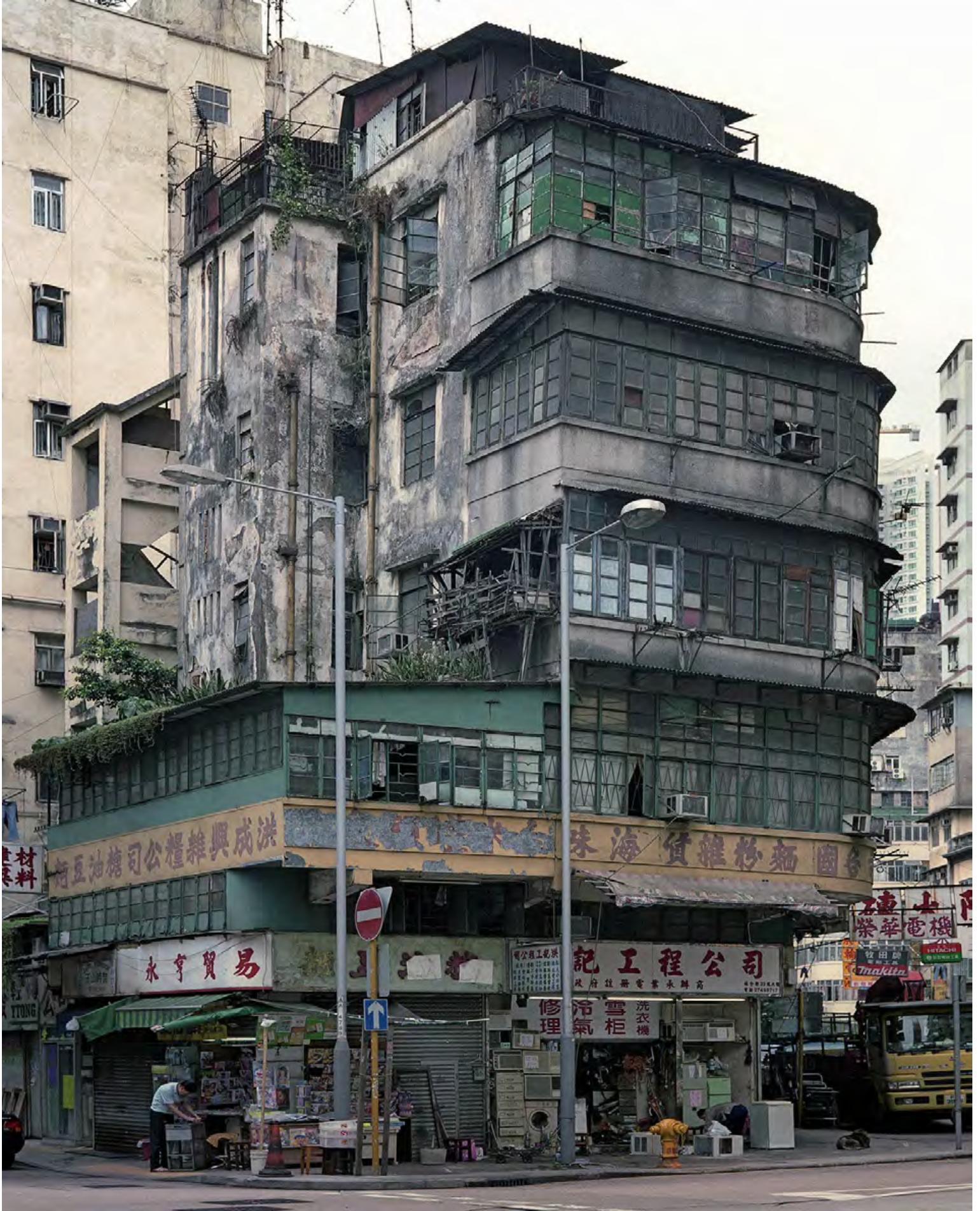
Hong Kong Corner House #11, 2005-2011