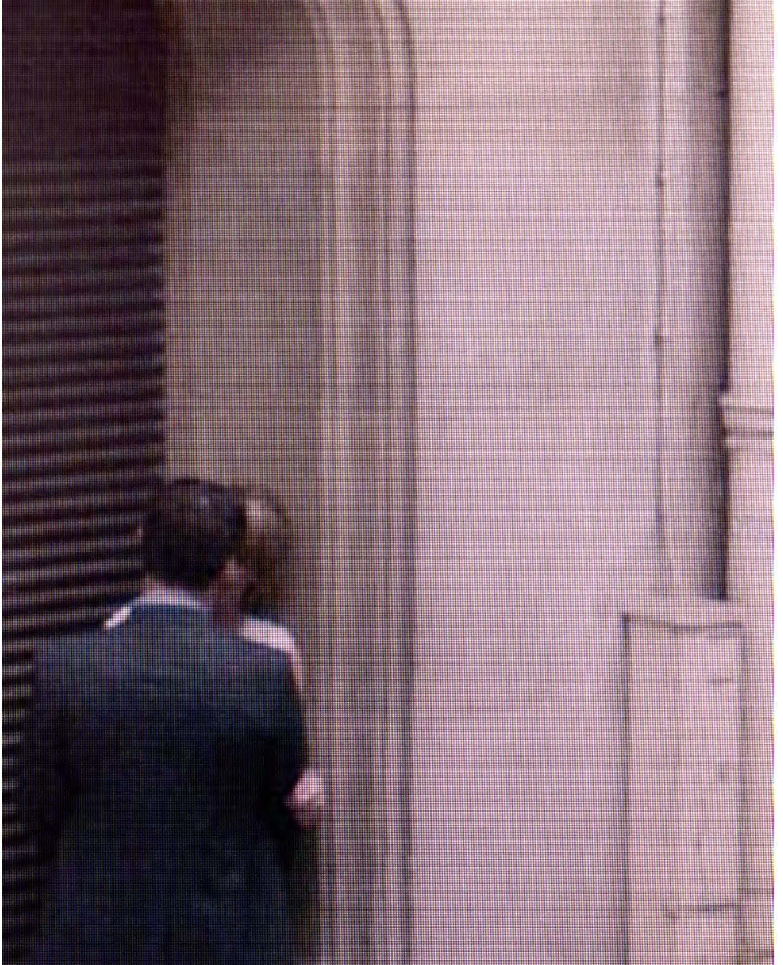
Paris Street View #16