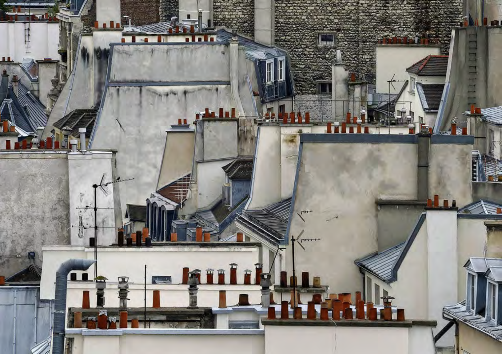
Paris Rooftop #1, 2014