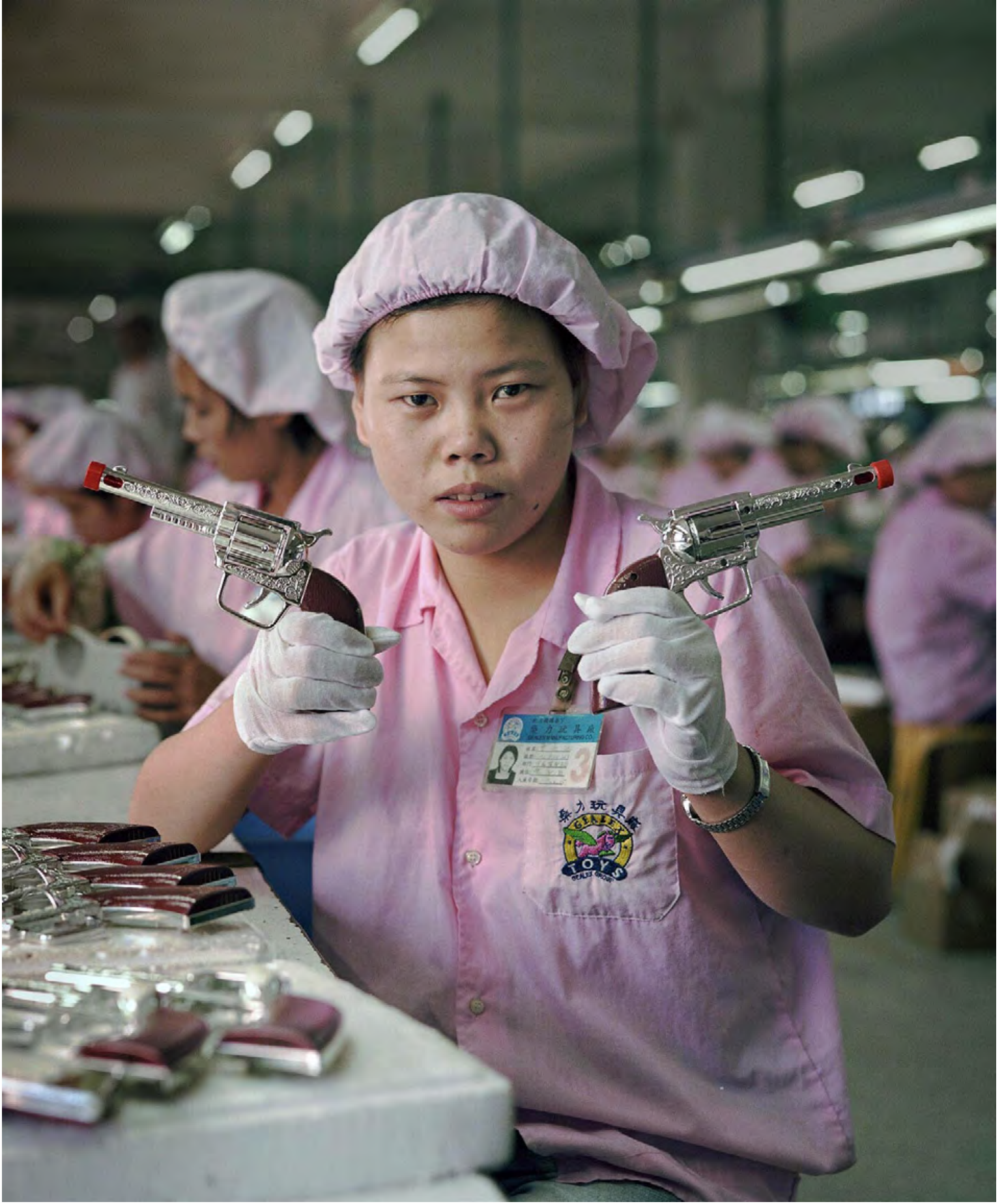
Toy Factory Portrait #2, 2004