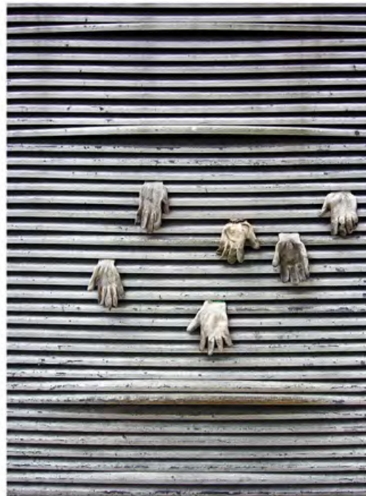
My Favorite Thing: Hong Kong Glove