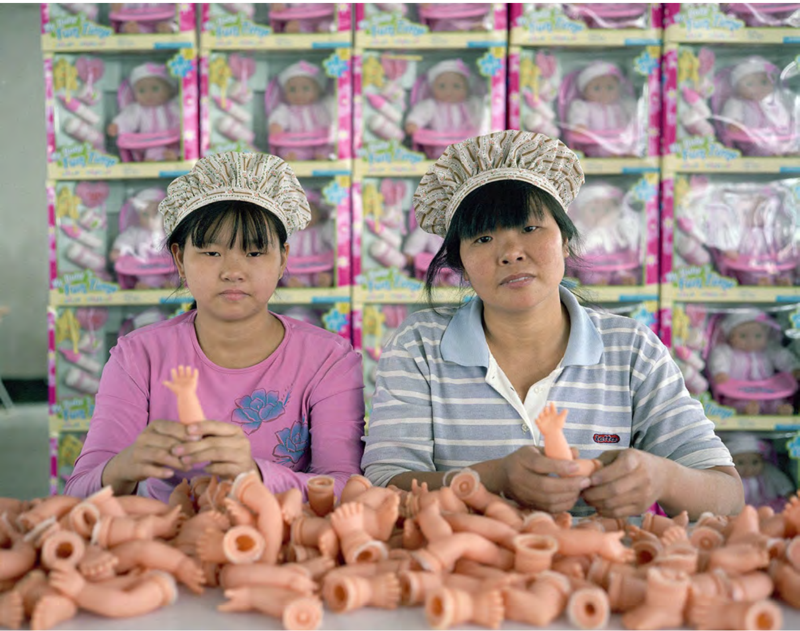
Toy Factory Portrait #19, 2004