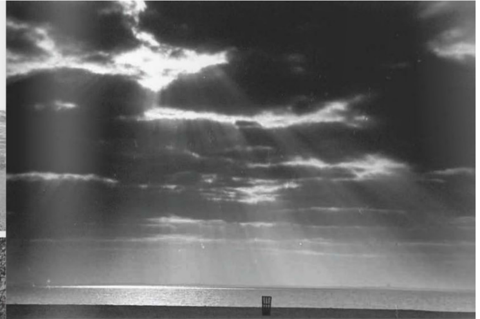
ABOVE: SUNSET AT SHERWOOD ISLAND STATE PARK, 1978 LEFT: WOMAN WITH BOOMBOX, 1980