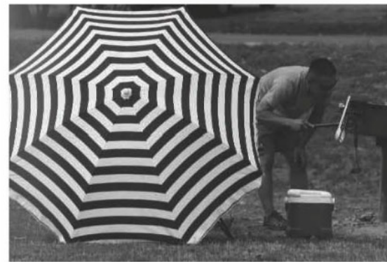
MAN BARBECUING NEAR UMBRELLA 2014 ABOVE: RELAXING AT THE BEACH, 2014