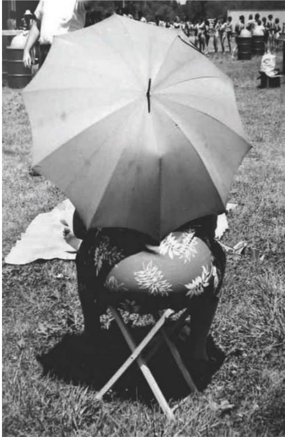
LEFT: WOMAN WITH UMBRELLA, 1980 BELOW, TOP TO BOTTOM: SITTING AT WATER'S EDGE, 2014 SEEKING SHELTER FROM RAIN, 1982 SNOW COVERED TABLES, 1981