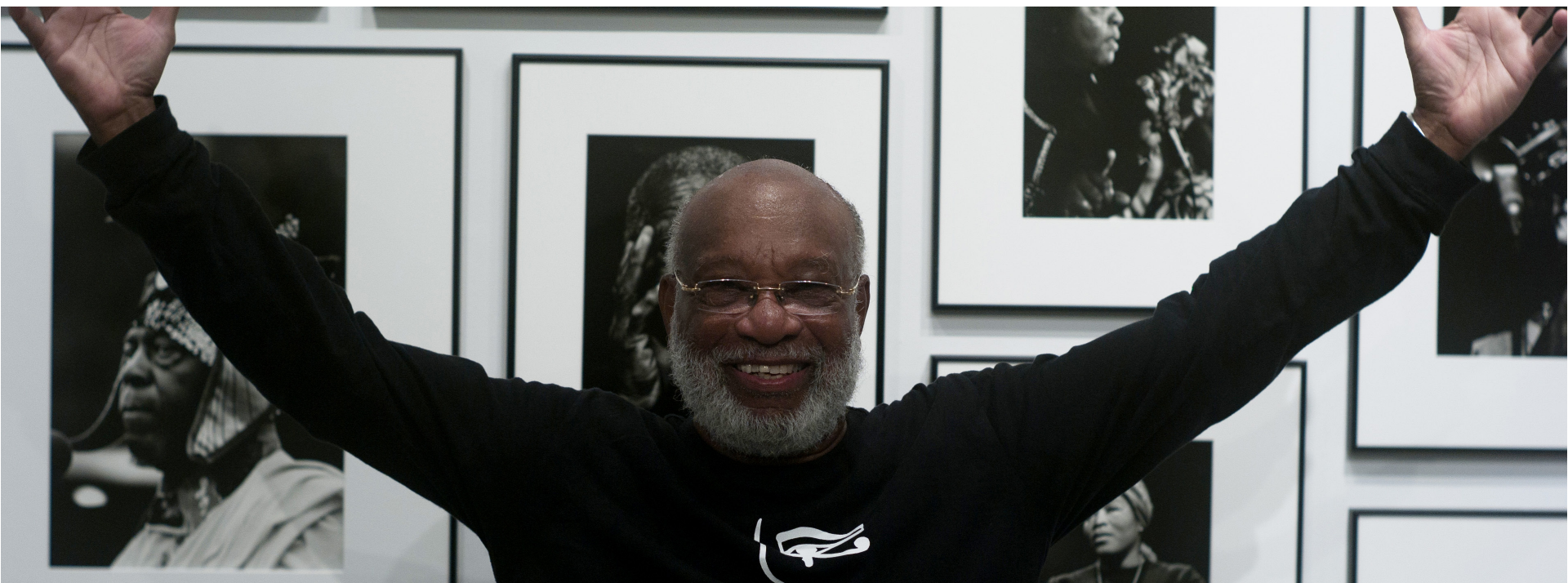
Photographer Chester Higgins Jr. poses in front of a few images from his Black Pantheon series.