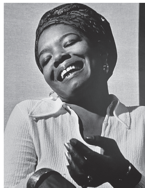
Poet Maya Angelou (Chester Higgins Jr.)